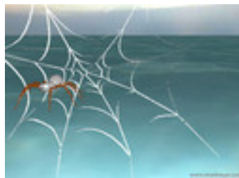
World Wide Web

The Apache Group develops the Apache web server and server-side Java , and XML projects. Heritrix is the web crawler used by the Internet Archive .